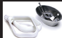
Bosch Cookie Paddle w/ metal drive