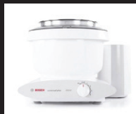
Bosch Kitchen Center